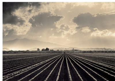
Roman Loranc, April Showers © 2013 Roman Loranc. All rights reserved.