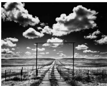
Roman Loranc, Private Road © 2013 Roman Loranc. All rights reserved.