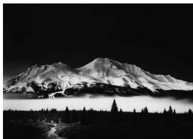
Roman Loranc, Avalanche Road © 2013 Roman Loranc. All rights reserved.