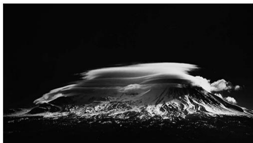
Roman Loranc, Cloud Dragon