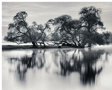
Roman Loranc, Bare Trees © 2013 Roman Loranc All rights reserved.